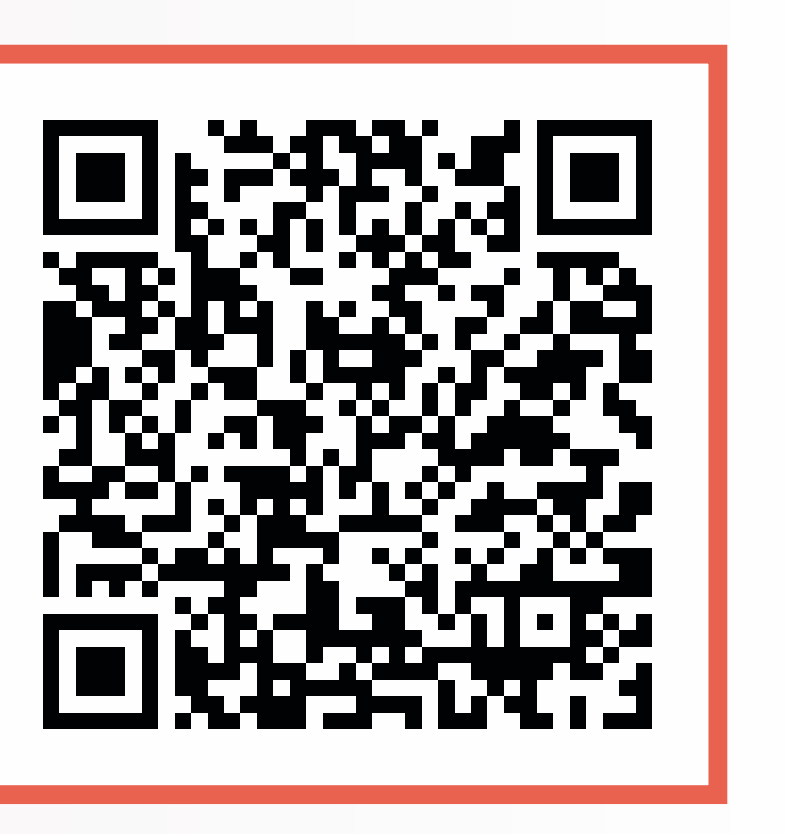
CARDIAC REHAB BENEFITS