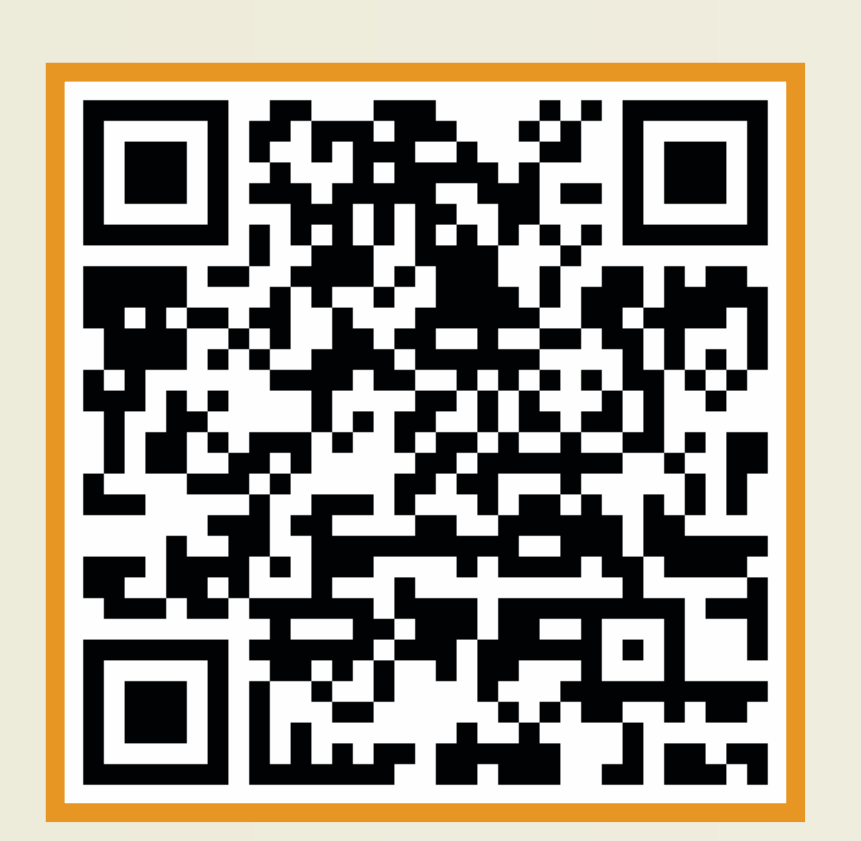
6 MINUTE WALK TEST

Learn about your health & potential risks