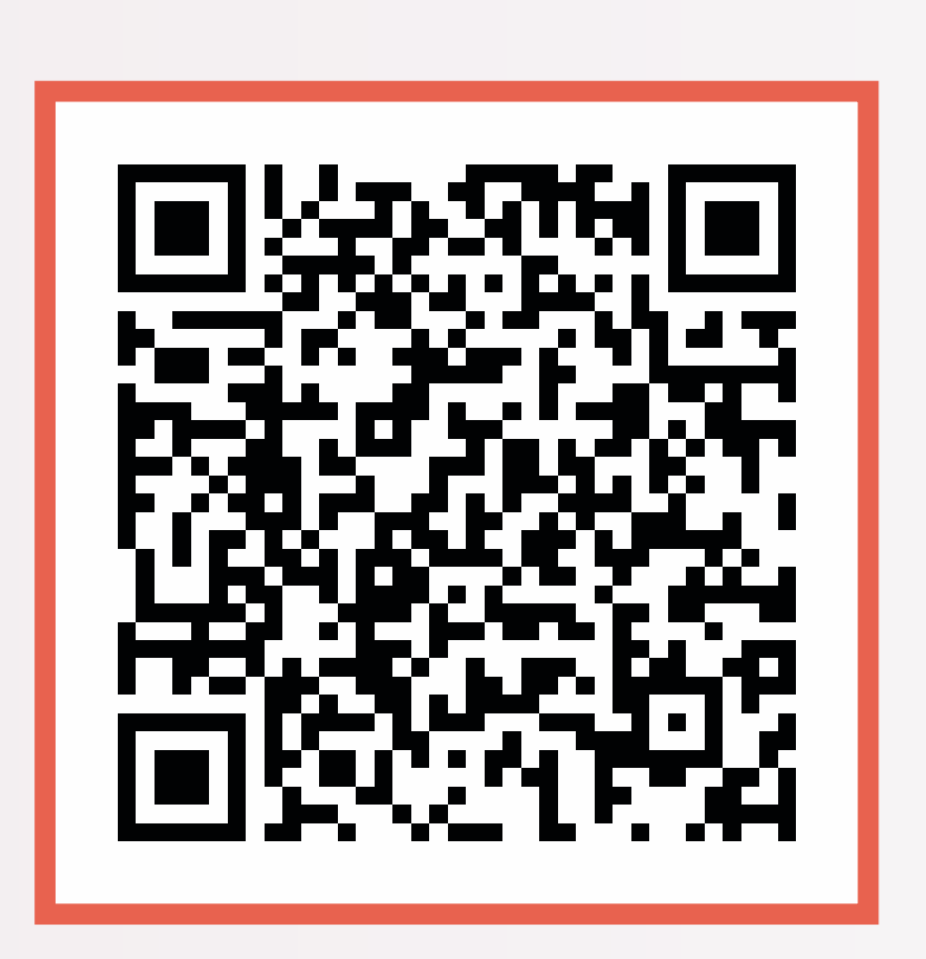
COMPLICATIONS OF DIABETES