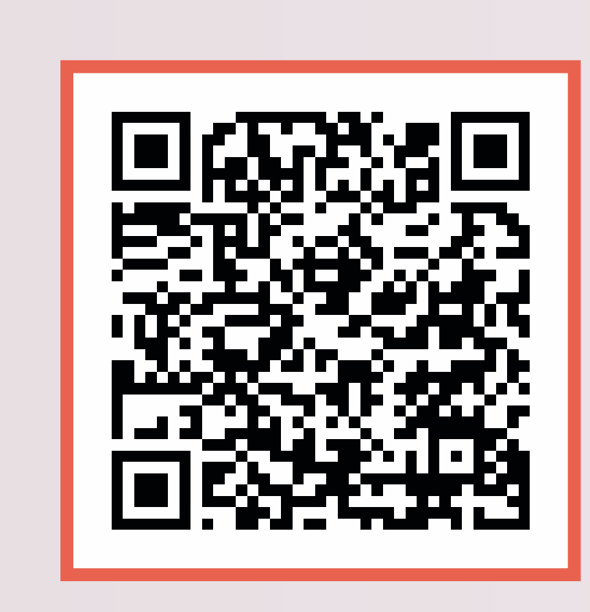
CHEST PAIN: CAUSES & TESTS