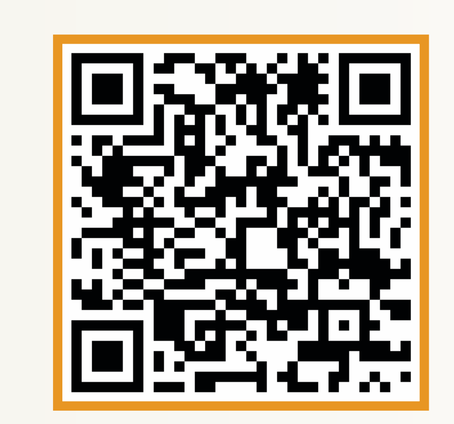
DIABETES RISK CALCULATOR