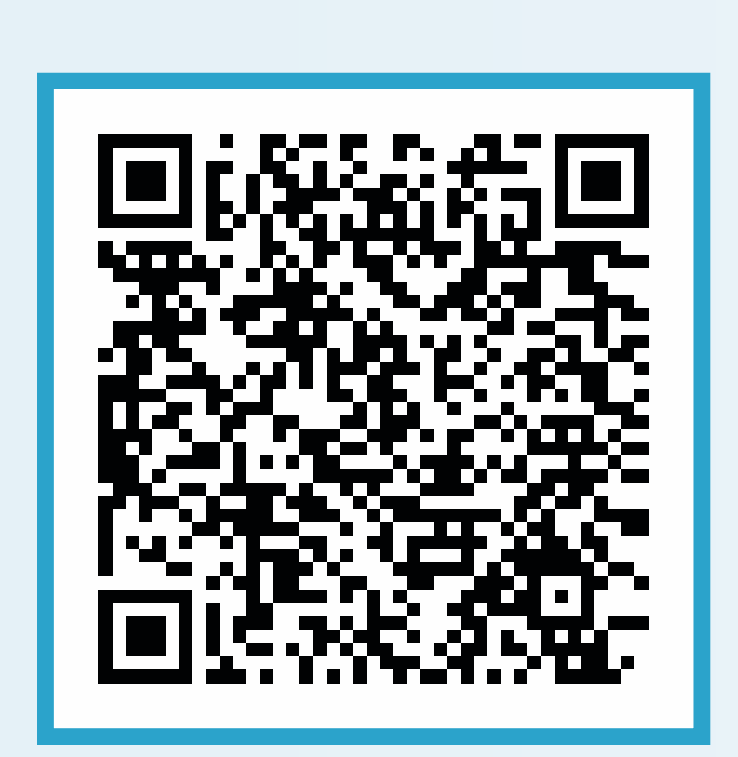
TYPE 2 DIABETES