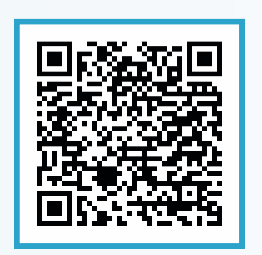
HEART DISEASE RISK FACTORS