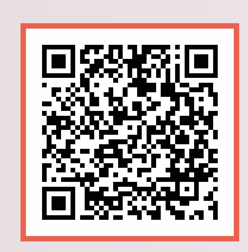
COMPLICATIONS OF DIABETES